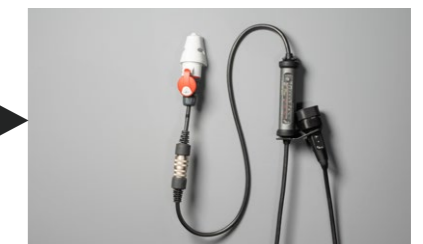
► JUICE BOOSTER 3 air + suitable adapter