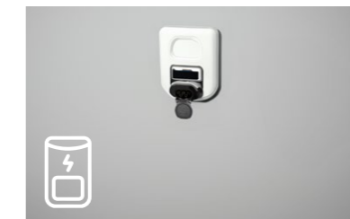
Scenario B: fixed wall charging station with socket