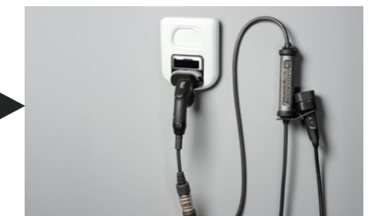
► JUICE BOOSTER 3 air + Type 2 adapter