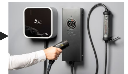
► JUICE BOOSTER 3 air + wall box adapter