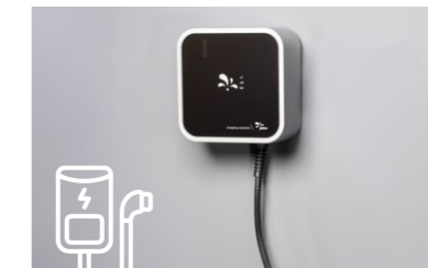
Scenario C: wall charging station with fixed cable